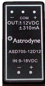
Unit measures 1"W x 2"L x 0.4"H